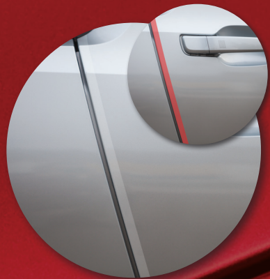
DOOR EDGE GUARD