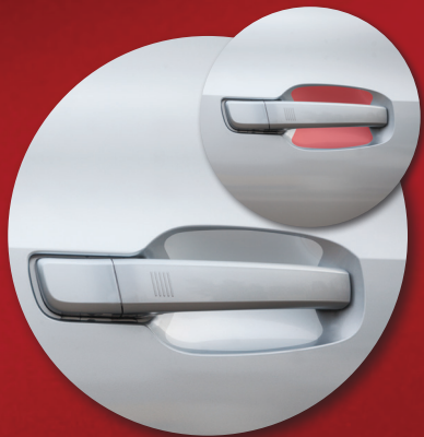
DOOR CUP GUARD

Ask your dealer about affordable DOOR Defense protection.